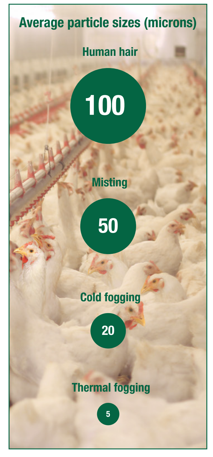
Smaller particles are able to travel and penetrate further.